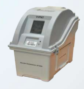
Voter Verifiable Paper Audit Trail