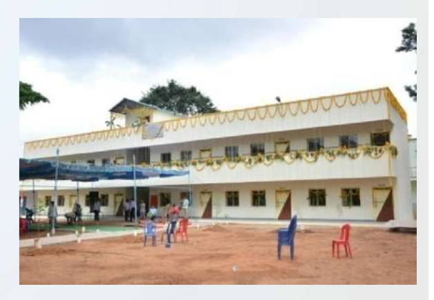
New buildings with classrooms and toilet blocks constructed at Cheemasandra, Mallimakanapura and Ronur Govt schools (Karnataka)