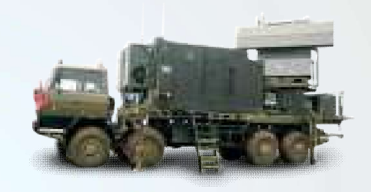
3D Tactical Control Radar