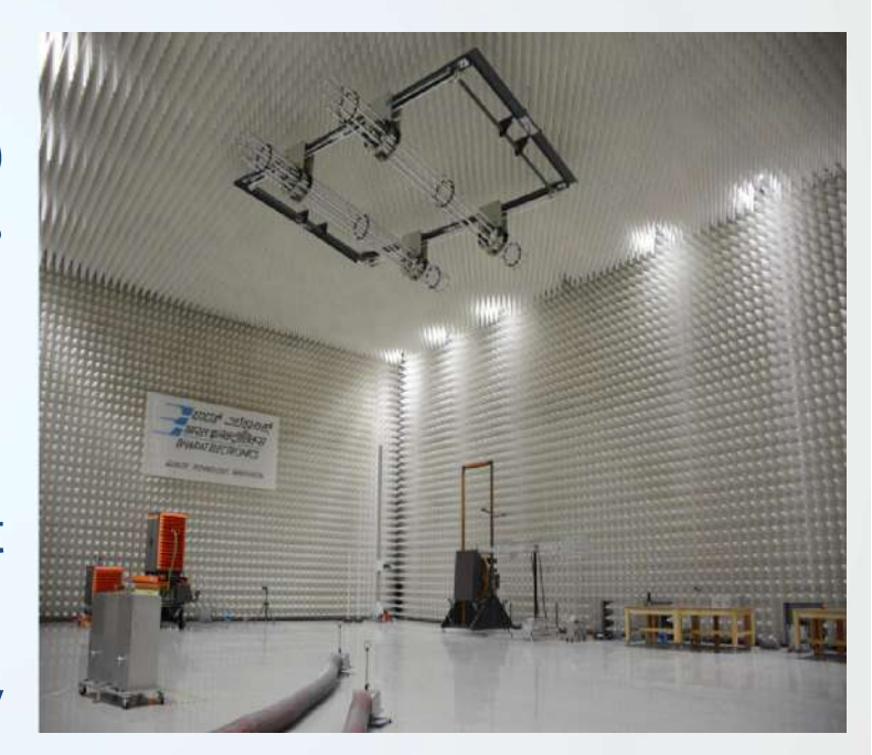
Electro Magnetic Compatibility (EMC) Chamber for system level testing