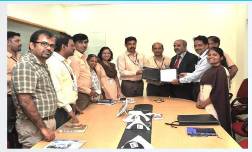
Signing of MoU for providing Mobile Cancer Detection Unit to Kidwai Institute of Oncology