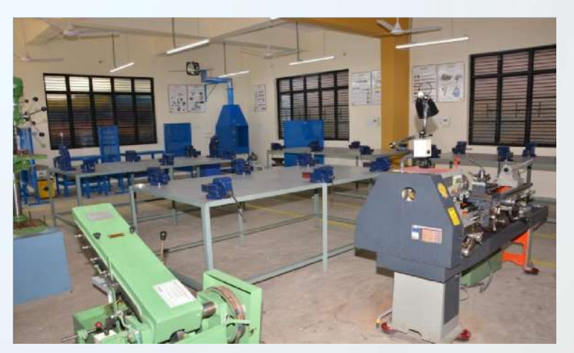
Inauguration of the new Electronic Mechanic Lab and Fitter Workshop established at adopted Government ITI, Gowribidanur, Karnataka