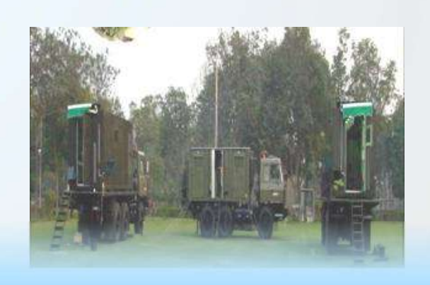
Battle Field Surveillance System