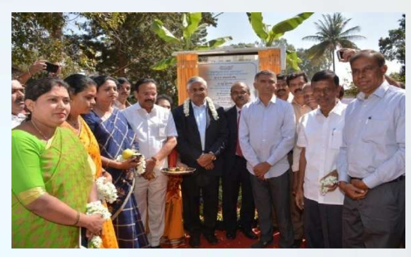
Foundation stone laid for the installation and commissioning of Sewage Treatment Plant at Doddabommasandra Lake, Bengaluru, Karnataka